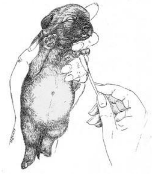
Figure # 2 Head held erect