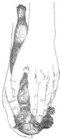
Figure # 4 Figure Supine position